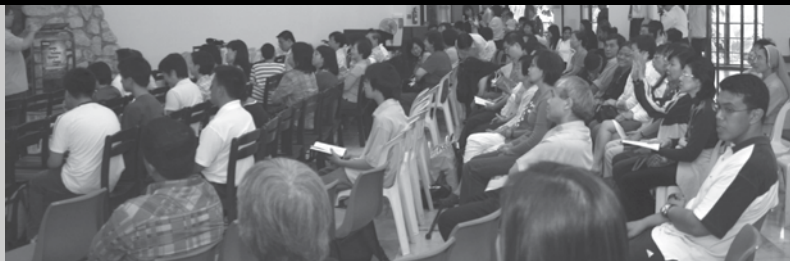
Prayer warriors filling the Chapel on a Saturday afternoon.

The event was organised by the seminarians together with the Archdiocesan Vocation Team, Serra Club of Singapore and supported by Amplify (formerly called “Youth Praise Ministry”). †