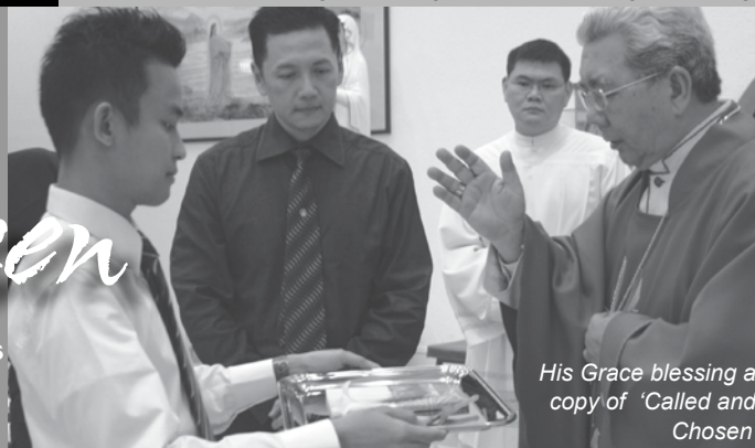
His Grace blessing a copy of 'Called and Chosen'

Archbishop Launches Book on Vocation Stories of Local Diocesan Priests at Feast Day Celebrations at Seminary