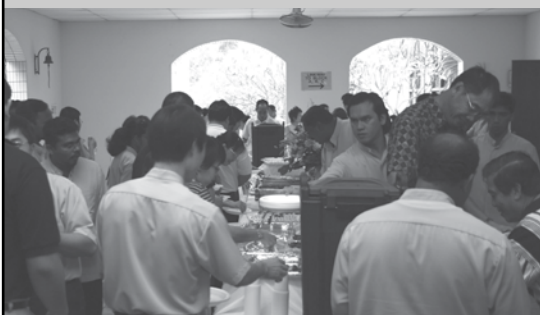
Seminarians and prayer warriors taking time to have fellowship and share a snack together during the tea-break